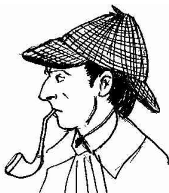
Data as Sherlock Holmes.

I know who the winners are but isn't at liberty to divulge that information until after the Region One Summit.